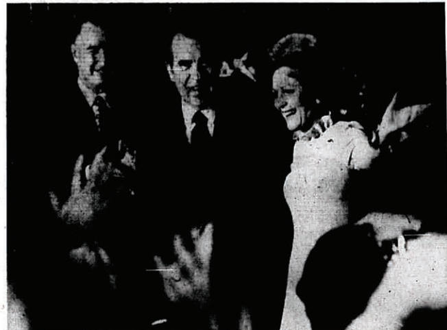
President and Mrs. Nixon join Vice President Agnew at victory celebration.

Five miles away the fire department on Jekyll Island dispatched an ambulance, and the driver radioed that "12 cars have sunk and a pickup truck is floating."