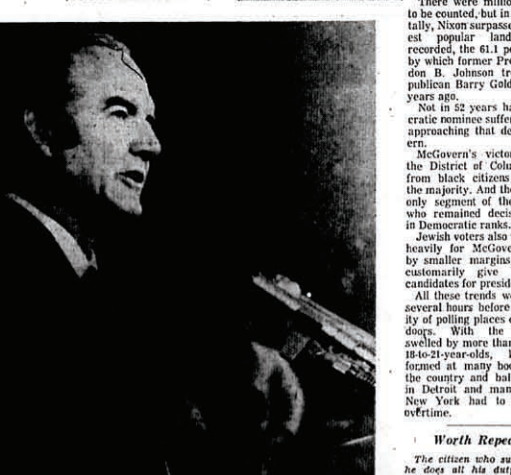
A badly defeated McGovern tells supporters he has conceded.

Second Class Postage Paid at Allentown, Pa. 18102