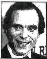
Rep. Don Ritter ... cites voters in 'middle'