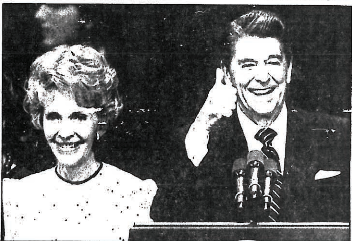
President Reagan gives 'thumbs up' sign as first lady smiles after whopping victory.